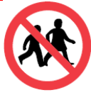
No Child Allowed