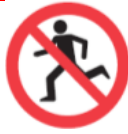
Do Not Run