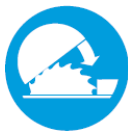
Use Adjustable Guard