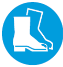
Wear Foot Protection