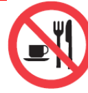
No Eating & Drinking