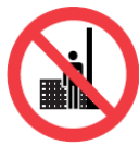
Do Not Use Hoist For Transport People