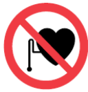
No Entry for People with a pacemaker