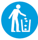
Use Litter Bin