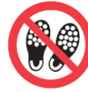
Do Not Wear Metal Studded Footwear