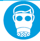
Wear Respiratory Protection