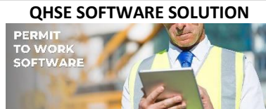
Safety Permit Software www.QHSEalert.com