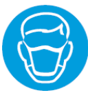
Wear Nose Mask