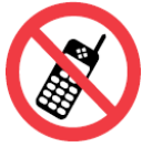
Do Not Use Mobile