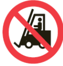
No Forklift Allowed