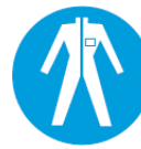
Wear Protecting Clothing/ Suit