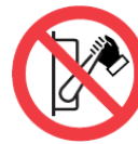
Do Not Operate