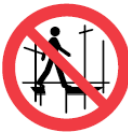
Do Not Use Scaffolding