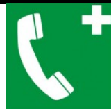
First Aid Phone