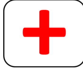
Sign of First Aid as per State Factory Rules