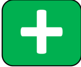
Universal Sign of First Aid