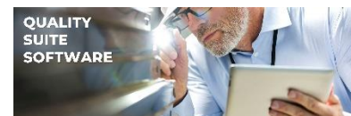
Quality Control Software