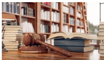
Legal Library Environment + Safety + Human Resource https://bit.ly/Legal_Lib