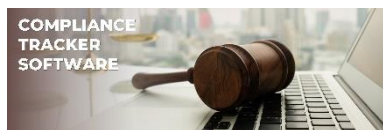
Legal Compliance Software

IMS Lead Auditor Course 9001 + 14001 + 45001 (Combo) https://bit.ly/LAC-IMS-EL